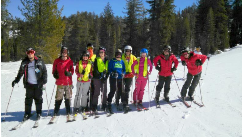
The Special Olympics of Northern California

(SONC) Winter Games has had two practices at China Peak. The first one on January 27 greeted the many athletes, coaches and volunteers with great weather and snow conditions. The second practice on February 10 was just as exciting with the weather cooperating but the conditions a little icy in the morning and slushy in the afternoon. Everyone is looking forward to the three-day trip scheduled for February 21-23.